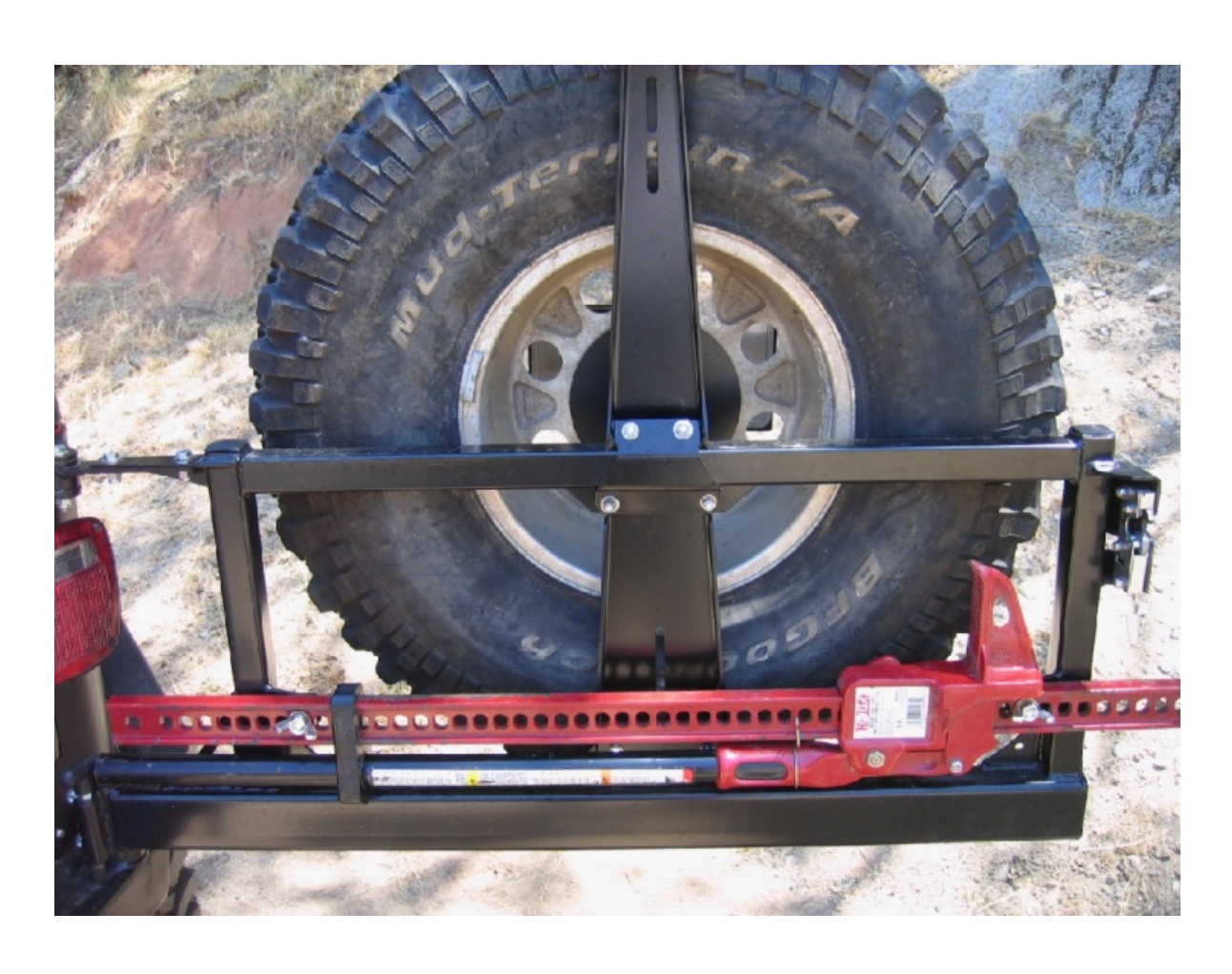
Complete tire carrier shown with 48" Hi-Lift. MAKE SURE TO RE-CHECK ALL HARDWARE AFTER 500 MILES AND EVERY OFF-ROAD USE.

Place Hi-Lift along the tire carrier to allow for easy access to the dead-man pivot handle as shown.